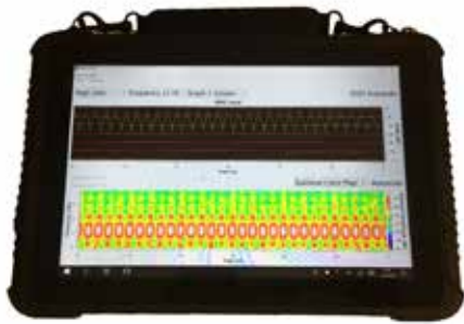
Trident 500 Electromagnetic Receiver & Ruggedised Tablet

The receiver is capable of detecting multiple EM signals and displaying all using PigView software.